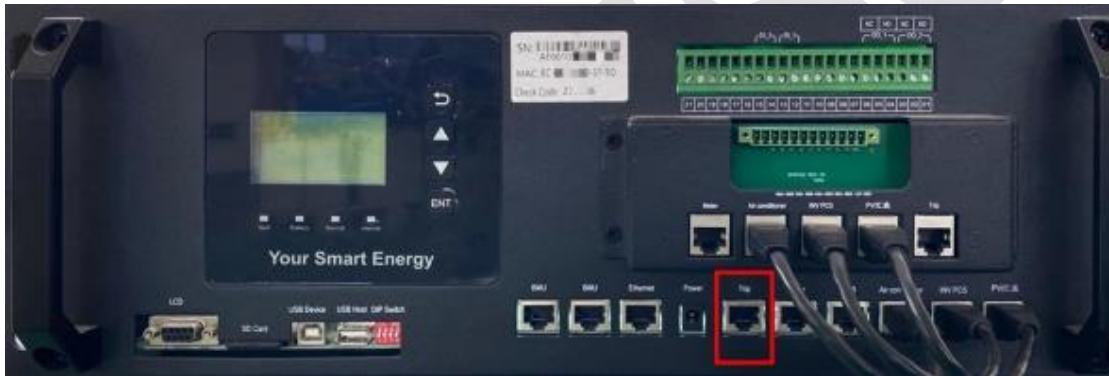
Fig. 1. EMS communication board schematic image

The dispatch communication port is the EMS Trip port in Fig. 1. The pin sequence is 3-B, 6-A , which is shown in the schematic in Fig. 2.